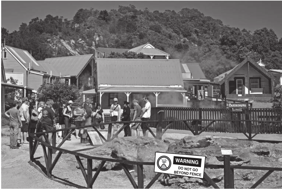
A group of tourists viewing a geothermal vent as part of a guided tour.